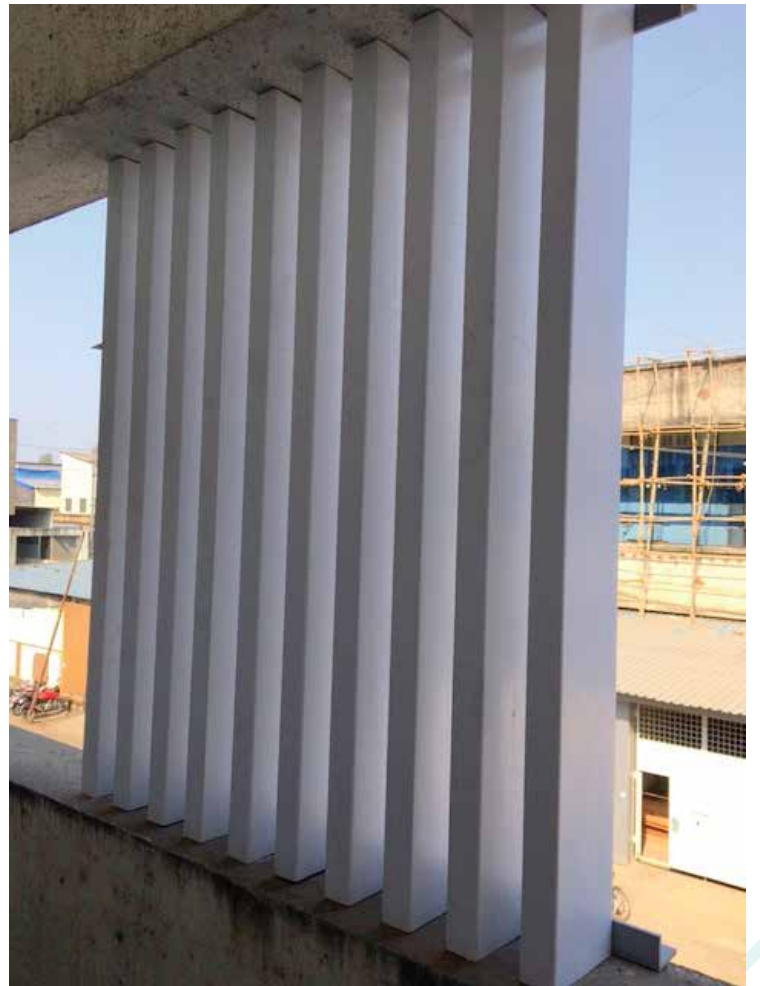
150 x 50 Rectangle Fitting