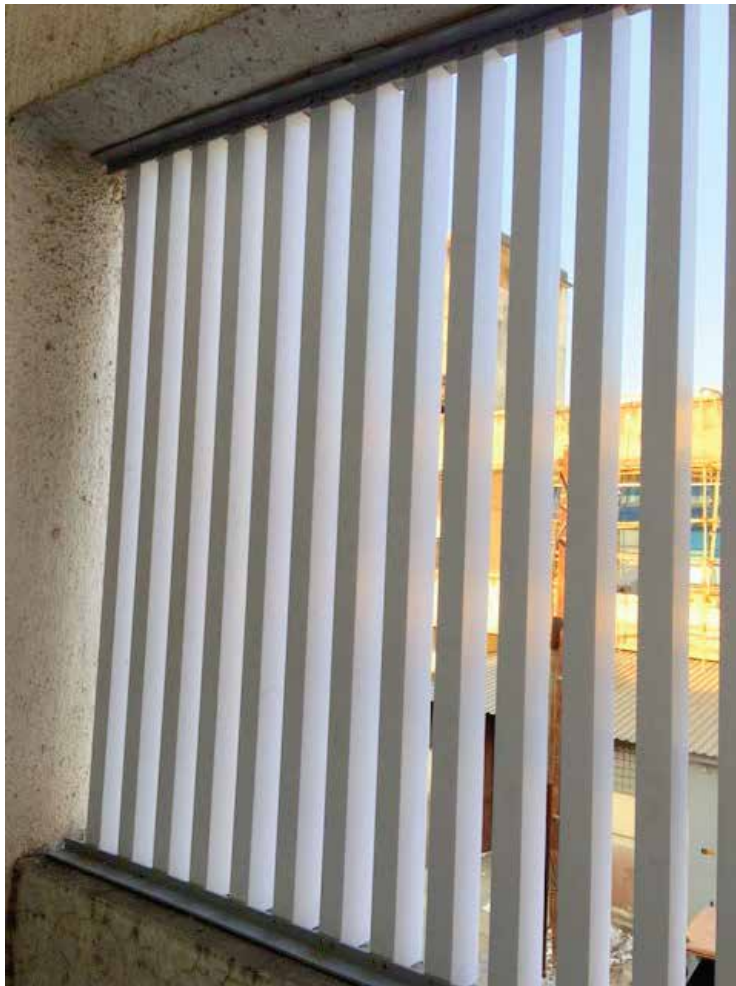
70 x 40 Rectangle Fitting